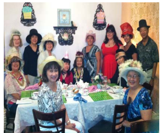
"Celebration – 2012" A Cup of Tea