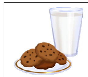
What could be better than fresh baked cookies?!

Who will sell/eat the most bags of cookies in our Chapter? Will it be you?