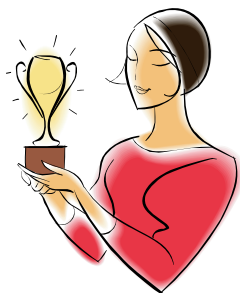
Best Practices Award 2010 for Na Kilohana O'Wahine Chapter!!!