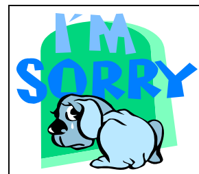
Reasons to Forgive...