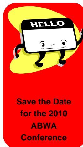
Save the Date for the 2010 ABWA Conference

October 28-30th Chattanooga, Tennessee to see: Rock City Gardens, Ruby Falls, Buttonwillow Church Civil War Dinner Theatre, Riverbend, Coolidge Park, and the Chattanooga Choo Choo!!