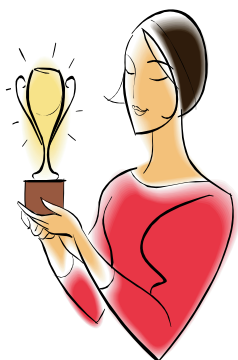
2010 Best Practices Award for Na Kilohana O Wahine