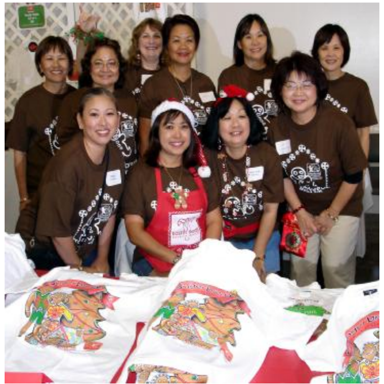
ABWA Volunteers help sell out t-shirts for Easter Seals Hawaii at their annual gingerbread festival.