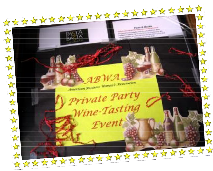
A Taste of Italy Apríl 3, 2008 Pasta and Basta