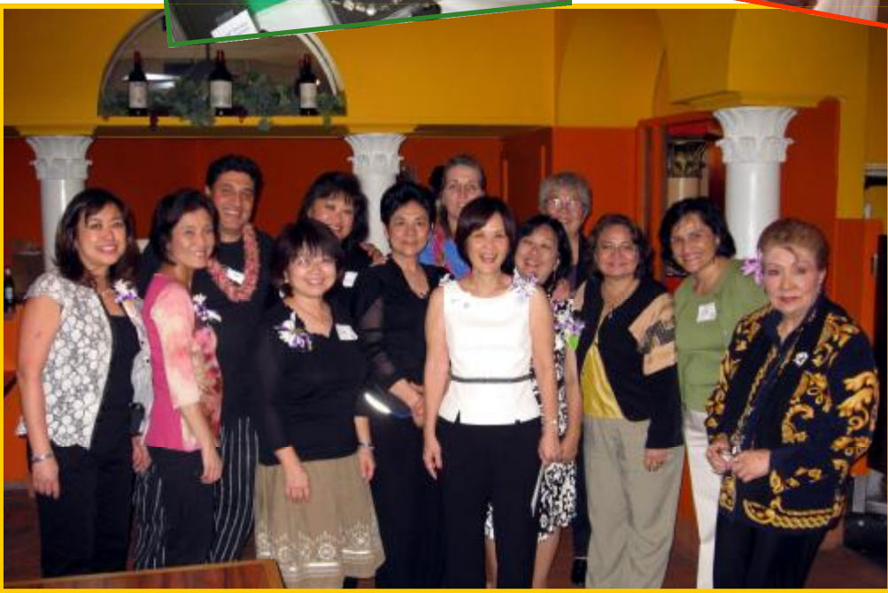
Raffles & a silent auction were evening highlights