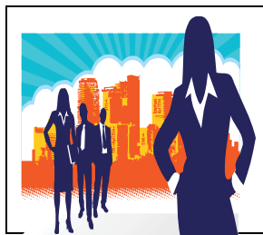
Women IN Business