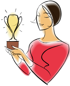
Best Practices Award 2010 for Na Kilohana O'Wahine Chapter!!!