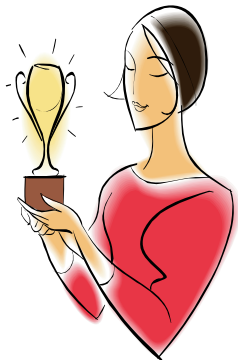
2010 Best Practices Award for Na Kilohana O Wahine