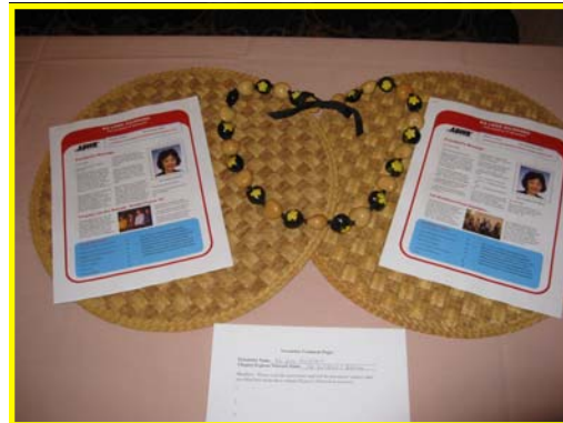
Our newsletter display at Spring Conference