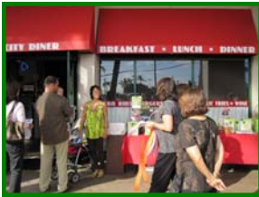
Lucky Raffle Drawings!