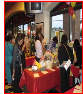
Friends! Food! Fun!