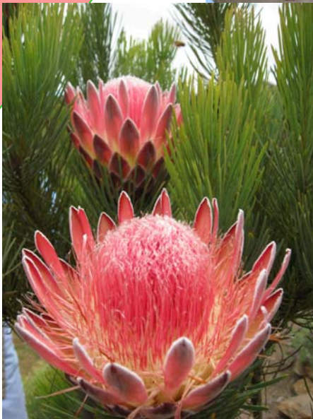
There were still remnants of the Protea farm that existed prior to the lavender farm.