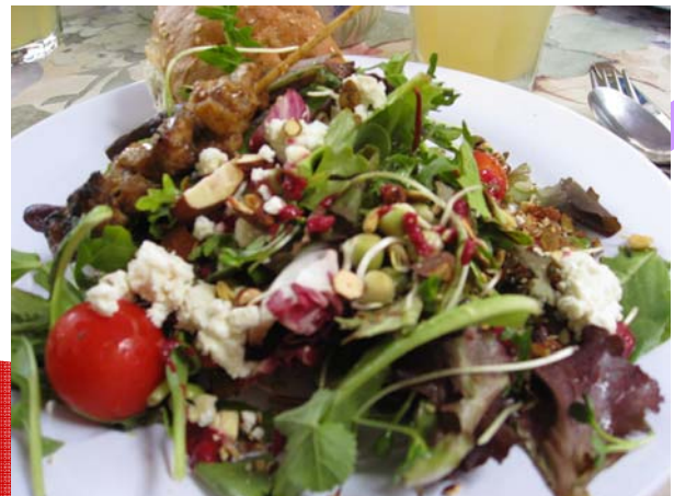
Organic garden salad