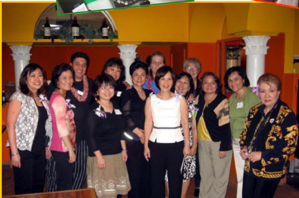
Happy group at the end of event