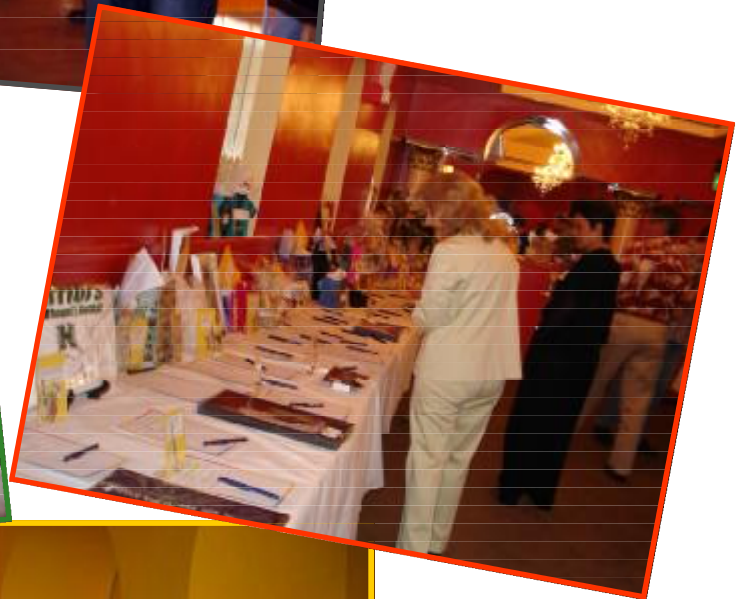
Raffles & a silent auction were evening highlights