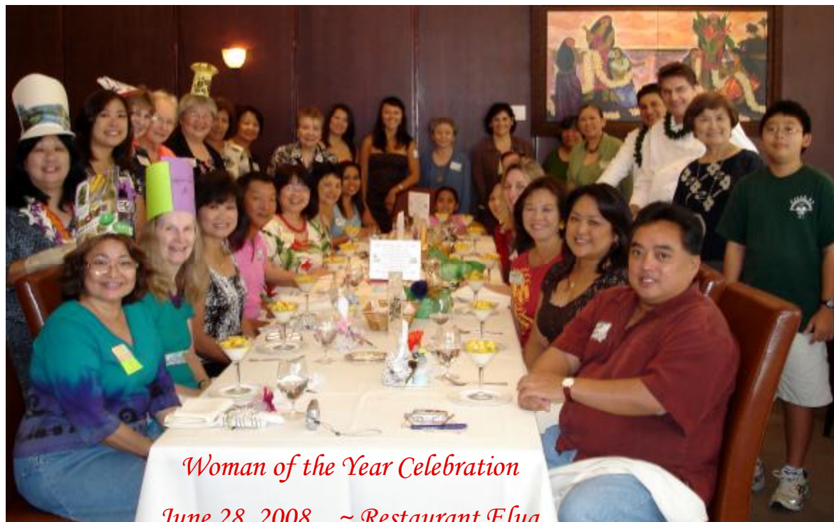
Woman of the Year Celebration June 28, 2008 ~ Restaurant Elua